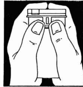
FIG. 5 Snap down Lock-N-Seal Latch to avoid accidental opening during transport.