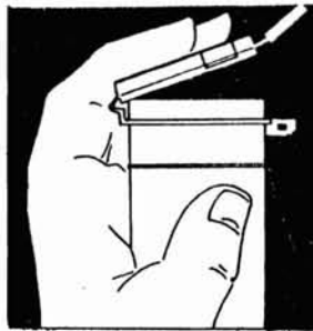
FIG. 4 To close, press down on lid from behind using forefingers. Snap shut and firmly press to sealing ring.