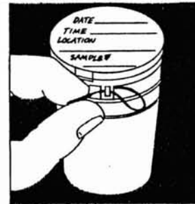
FIG. 6 Pull custody tie thru hole in latch & complete information on sample label. (Custody tie & pre-applied labels are optional.)